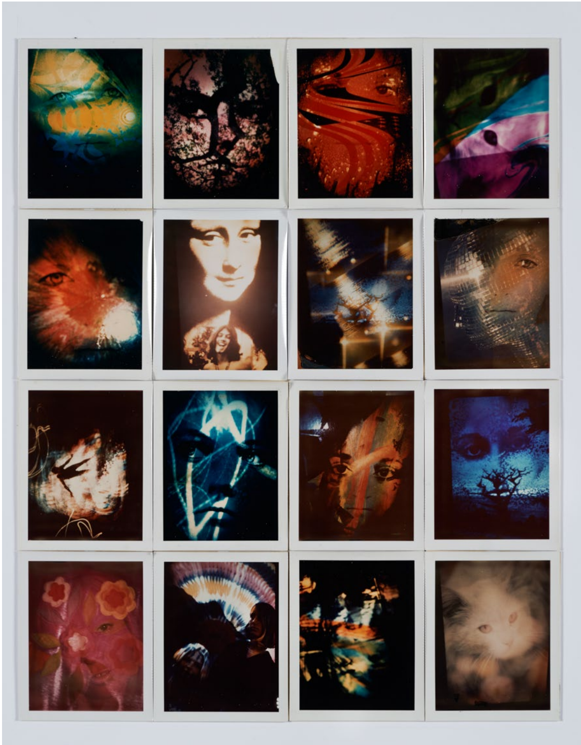
Kali, Untitled (Collage #11) , Palm Springs, CA 1973. Vintage polaroids mounted on board. Columbus Museum of Art, Museum Purchase.