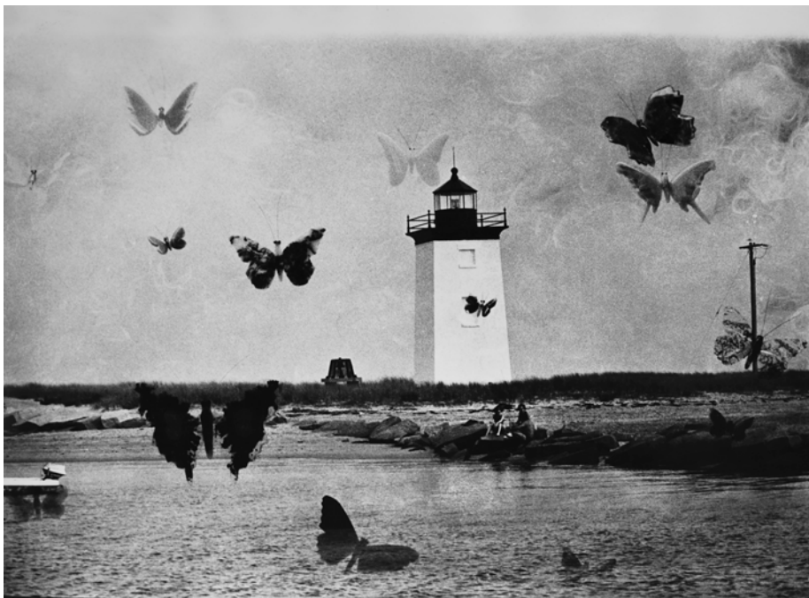
Kali, Maine Lighthouse with Butterflies , 1969. Archival pigment print mounted on dibond. Estate of the Artist.